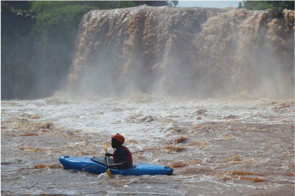
30m Sagana Waterfalls near the starting line.