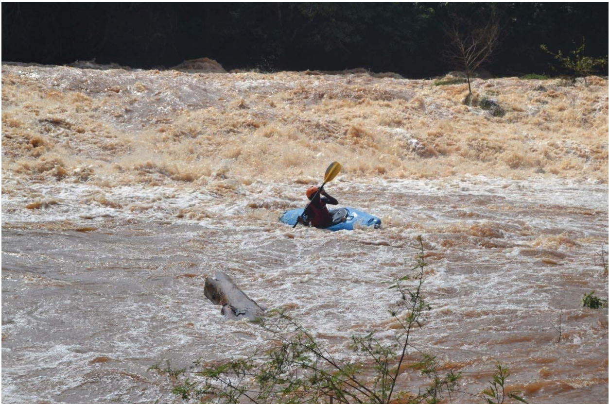
Sagana Racing Course High water season (May)